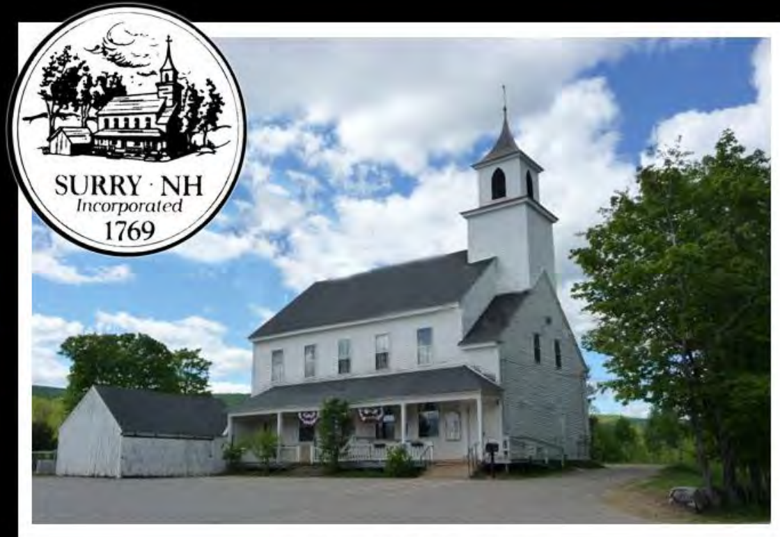
Surry Town Hall

Town Officers & Inventory of Ratable Property Of SURRY, New Hampshire